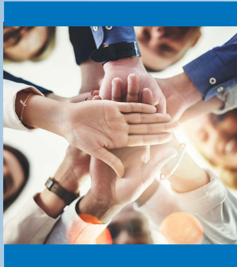
MEET THE TEAM