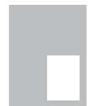
1/4 Page 3 1/2" x 4 1/2"